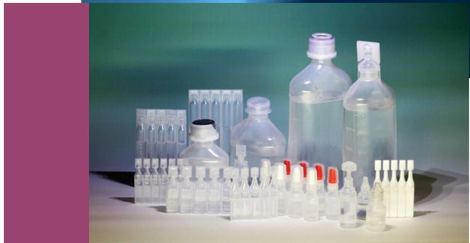
Typical products produced with ASEP-TECH® Model 640 Blow/Fill/Seal packaging system