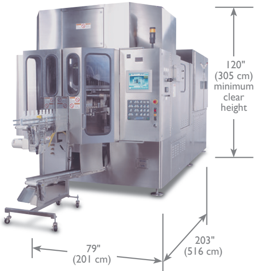
Model 640 dimensions